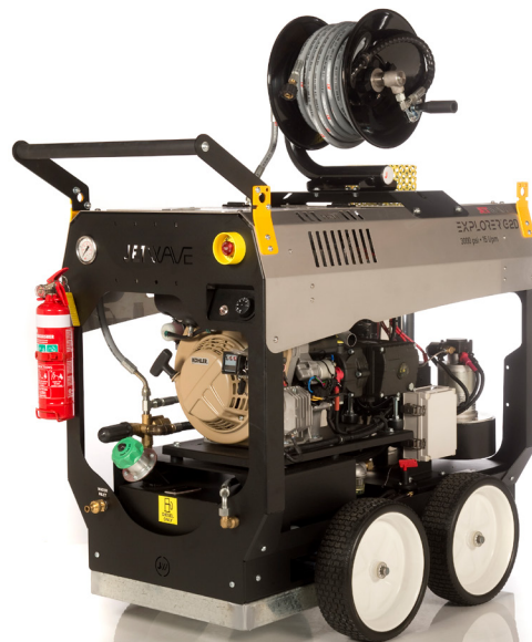
SHOWN WITH OPTIONAL TROLLEY KIT, MINESPEC KIT & HOSE REEL