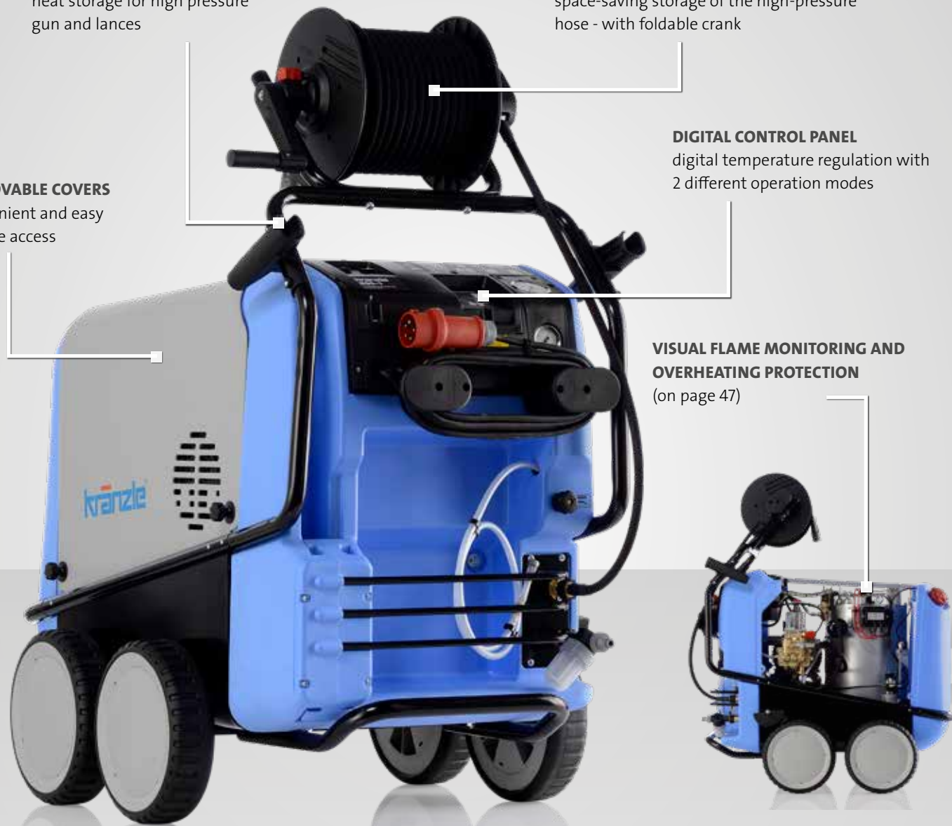
# 634410 therm 895-1

VISUAL FLAME MONITORING AND OVERHEATING PROTECTION (on page 47)