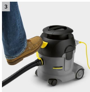
3 Foot switch for added convenience