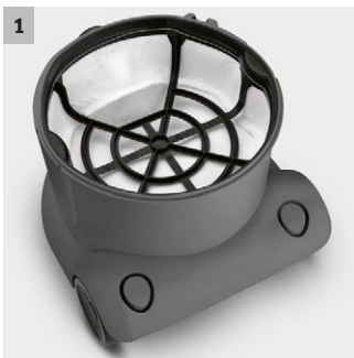
1 Large, round permanent main filter of washable nylon

With the new T 10/1 Professional we enlarge our dry vacuum program with a machine made especially for the target group building service contractors. It includes a pluggable power cord (12 m), an antistatic bend, a power cord integration, an extra strong main filter for vacuuming without filter bag and a coloured plug.