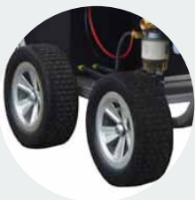
Solid, puncture-proof tyres

Specifications and details are subject to change without prior notice.