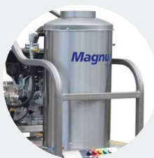
Poly diesel fuel tank with fuel filter